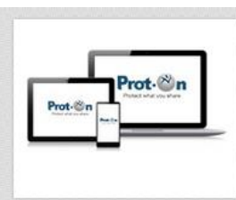
Access anywhere, anytime