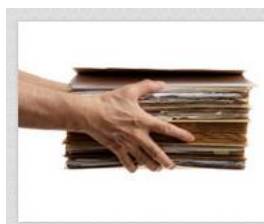
Prevent information leaks

Prot-On is the best tool to keep control of the files that you have shared. Even after they have been shared through any channel, you can still hold control and be the owner of the file. You can block access or change the user permissions remotely.