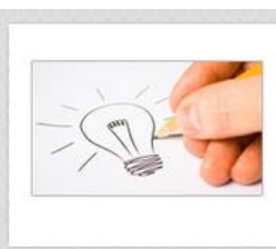
Protect your Intellectual Property